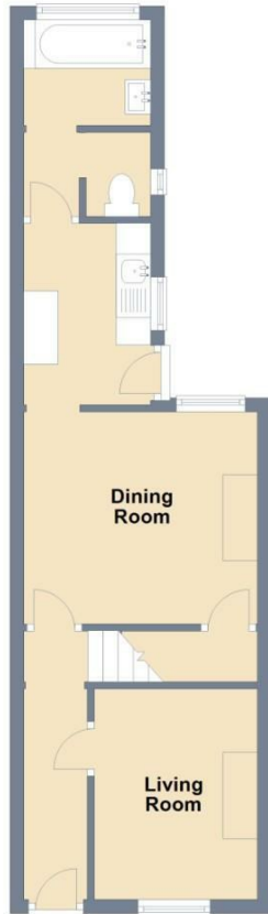
Ground Floor Approx. 34.6 sq. metres (372.0 sq. feet)